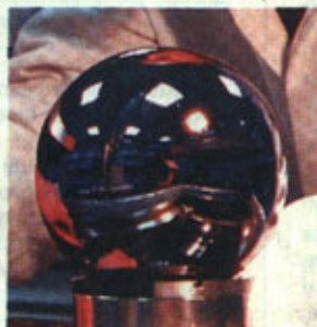
Silicon sphere Otto Pohl

A crystal sphere that weighs exactly one kilogram is created. Since its atomic structure is known, by measuring the sphere's diameter one can calculate how many atoms it contains. That number would define kilogram.